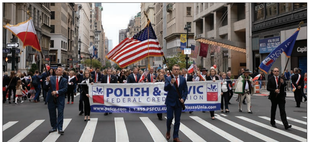
PSFCU contingent during last year's Gen. Pulaski Parade on Manhattan's Fifth Avenue