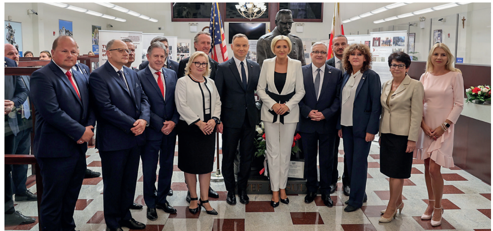
Commemorative photo during the Presidential Couple's visit to the PSFCU branch at 140 Greenpoint Avenue

On September 21, 2023, President of the Republic of Poland Andrzej Duda, together with First Lady Agata Kornhauser-Duda, visited the branch of the Polish & Slavic Federal Credit Union at 140 Greenpoint Avenue in Brooklyn.