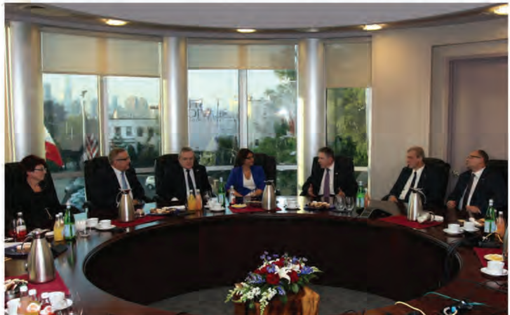
Photo of the meeting of Polish Deputy Prime Minister Gliński with Board of Directors