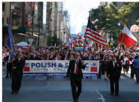
PSFCU employees and volunteers march up Manhattan's Fifth Avenue