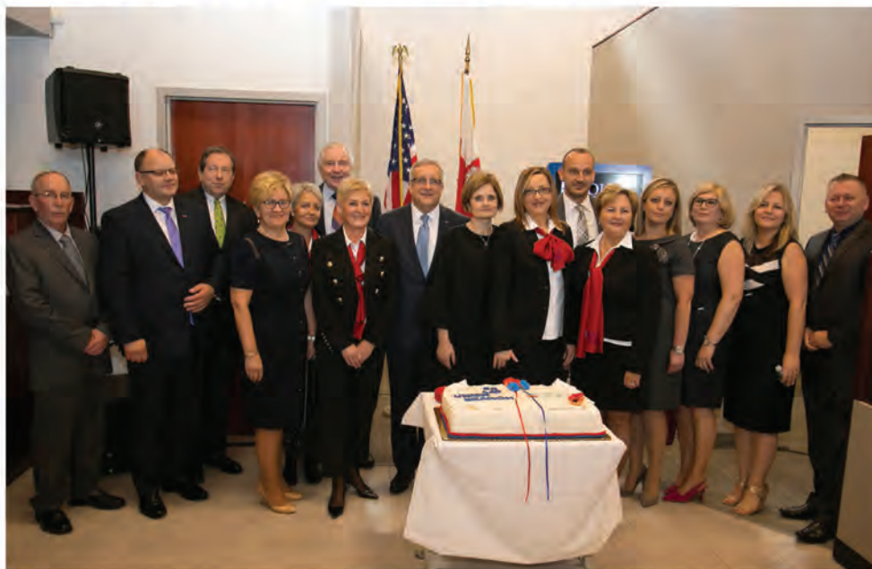
Commemorative photo of the ceremony of the 30th anniversary of PSFCU branch in Union

The Union branch was specially honored with a Certificate of Distinction from the St. Casimir Polish Supplementary School in Newark. "We are very grateful to our Credit Union for all your help. At the end of each school year we receive certificates and awards for our students, and PSFCU also