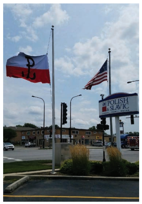
Commemorative flag near the Bridgeview branch

This is the second year in a row that the flag with the symbol of Fighting Poland will be waving in front of the headquarters of the Polish & Slavic Federal Credit Union. Like the flag raised in front of the PSFCU branch in Bridgeview near Chicago, for 63 days it will remind us of the heroism and tragedy of the Warsaw Uprising.