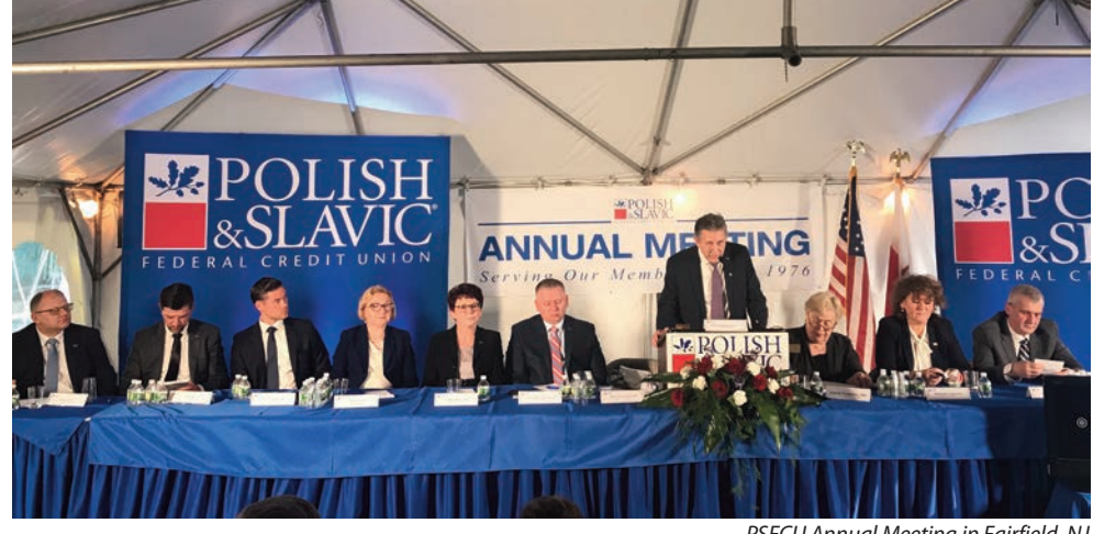
PSFCU Annual Meeting in Fairfield, NJ