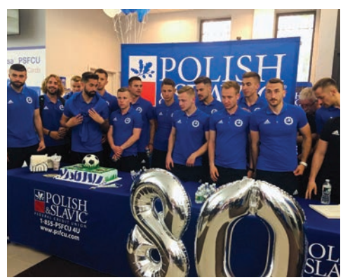
Stal Mielec soccer players in Ridgewood

The evening was a great success and best summarized by the management of