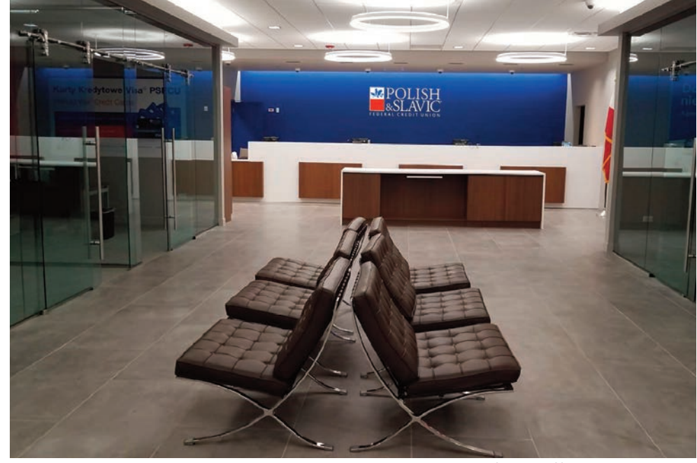
New and improved location in Mt. Prospect

So, allow us to welcome you to the new and improved Mt. Prospect branch at 1141 Mt. Prospect Plaza, Mt. Prospect, IL 60056. Monday thru Friday, operating hours are from 9:00 to 19:00 and on Saturday from 9:00 to 15:00. We are excited for the opportunity to serve and welcome our members at our new location.