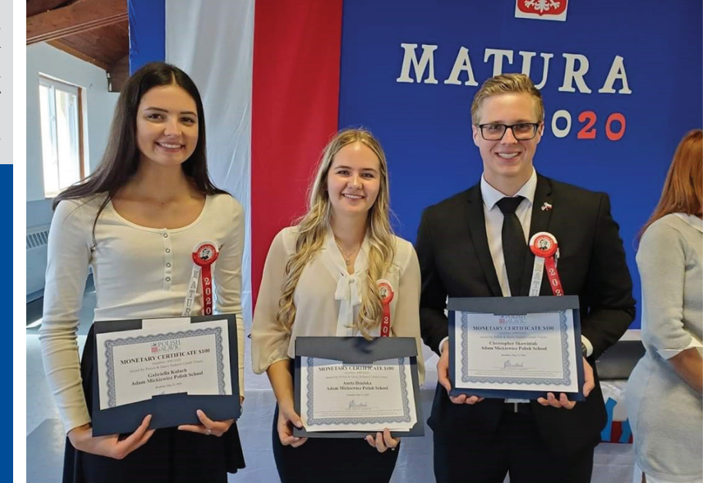
High-school graduates from Adam Mickiewicz Polish Supplementary School in Burbank, IL with their awards

Five PSFCU members received the high-...continued on page 2