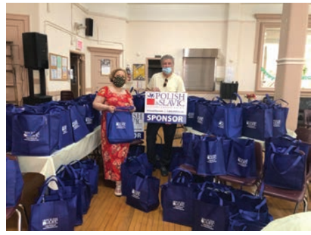
PSFCU sponsored food parcels for seniors

In June, we continued to provide assistance to people particularly affected by the COVID-19 pandemic. Benefiting from the support of the PSFCU Special Relief Fund, volunteers of Polish Filmmakers NYC carried out the third round of food deliveries. This time, with the assistance of priests from the parish of St. Stanislaus Kostka, food parcels went to Polish seniors residing at the Pete McGuinness Senior Center in New York's