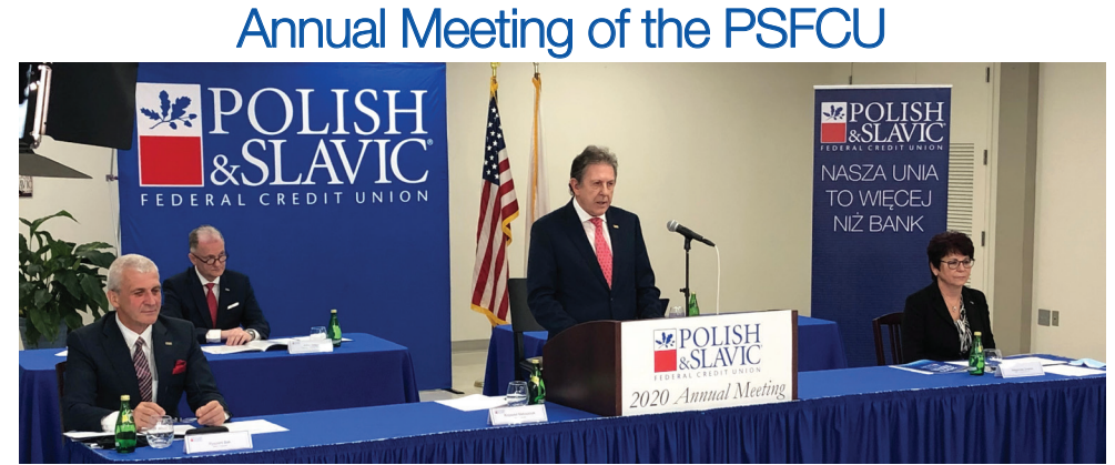
The PSFCU Annual Meeting was held in the form of videoconference and audio transmission.

$1,165,921,155 Net worth $210,827,451 Number of Members 102,310