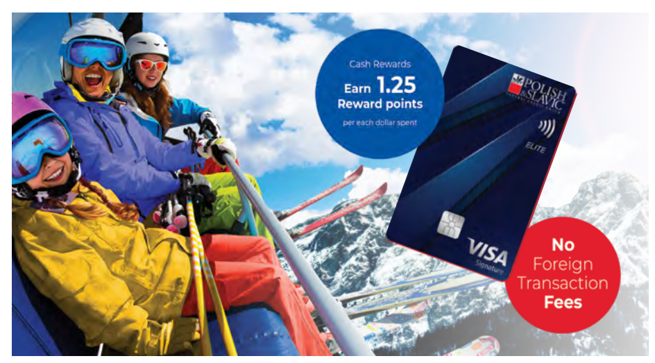
All PSFCU credit cards are subject to credit verification and approval. PSFCU membership required. Products are not available in all states. Other restrictions may apply. If you have any questions regarding credit cards offered by the PSFCU please contact the nearest branch or our member Service Center at 1.855.PSFCU.4U

For more information about the Scholarship Program, please contact the PSFCU Marketing Department at 973-808-3240, ext. 6133 or email scholarships@psfcu.net.