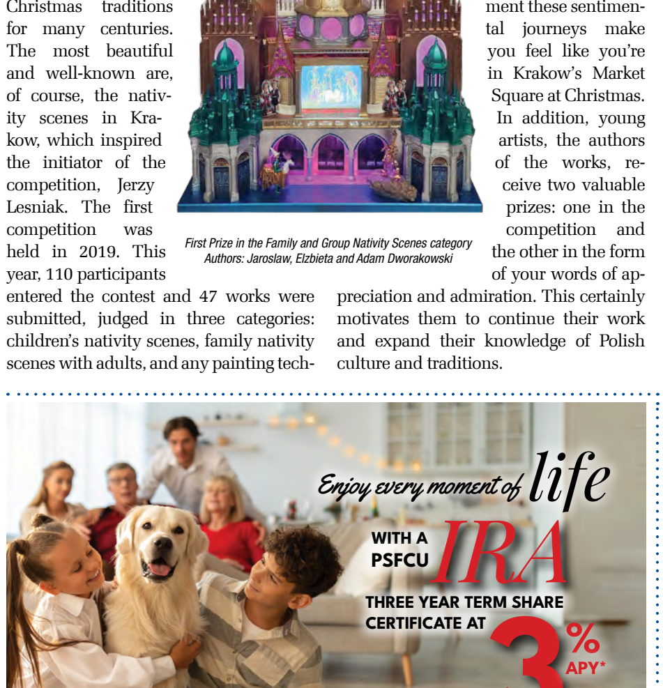
*Annual Percentage Yield. Promotional period begins on January 3, 2023 and ends on April 18, 2023. The minimum opening balance is $ 500.00. The maximum opening balance is the maximum amount of new contributions allowed for tax year 2022 and 2023. Early withdrawal penalty equal to 365 days of dividends applies to all 3-year (36-month) certificates. Business accounts are excluded from this promotion. PSFCU reserves a right to change promotional terms or end the promotion anytime without a notice All products and services are for PSFCU Members only. Other restrictions may apply.