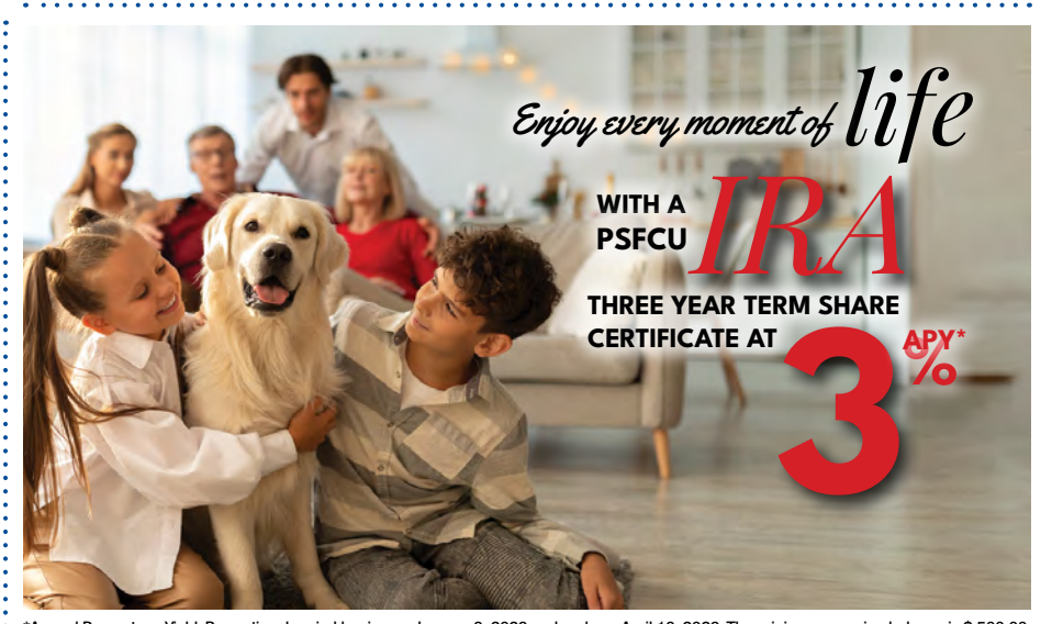
*Annual Percentage Yield. Promotional period begins on January 3, 2023 and ends on April 18, 2023. The minimum opening balance is $500.00. The maximum opening balance is the maximum amount of new contributions allowed for tax year 2022 and 2023. Early withdrawal penalty equal to 365 days of dividends applies to all 3-year (36-month) certificates. Business accounts are excluded from

Direct deposit is a fast, functional and secure method of receiving wages and recurring payments or benefits. Take advantage of this option and ensure your peace of mind and the safety of your money.