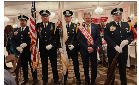
tion Day Parade in Chicago.